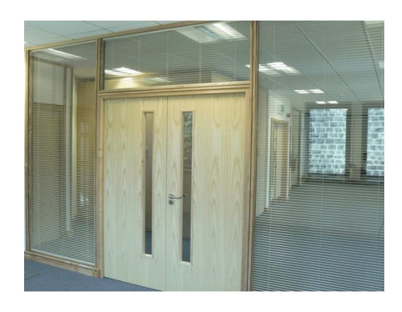
TDG - 6