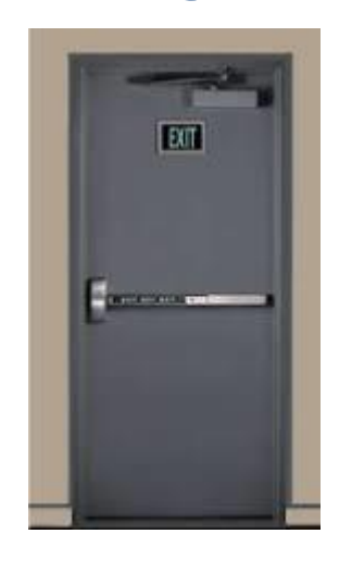
MDG - 32