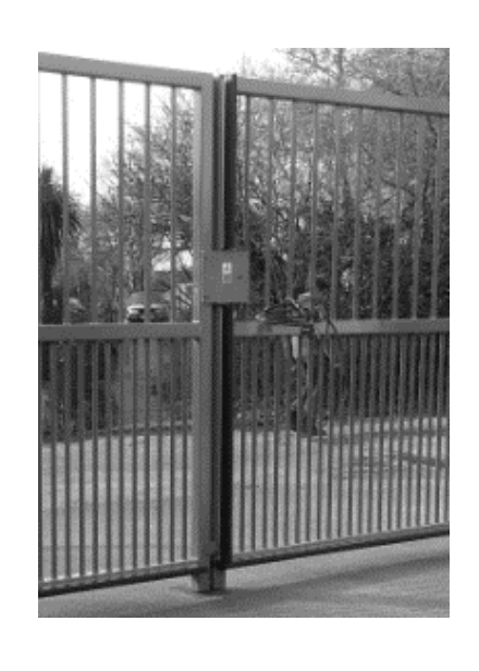
PGG - 107